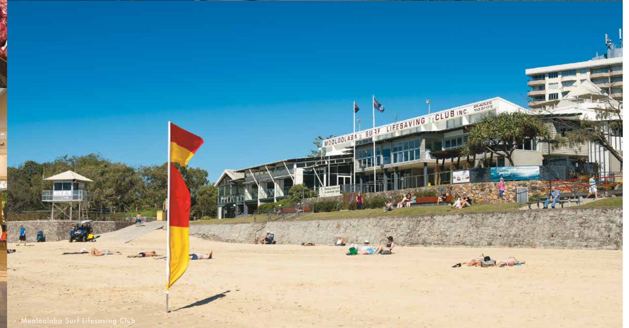
Mooloolaba Surf Lifesaving Club