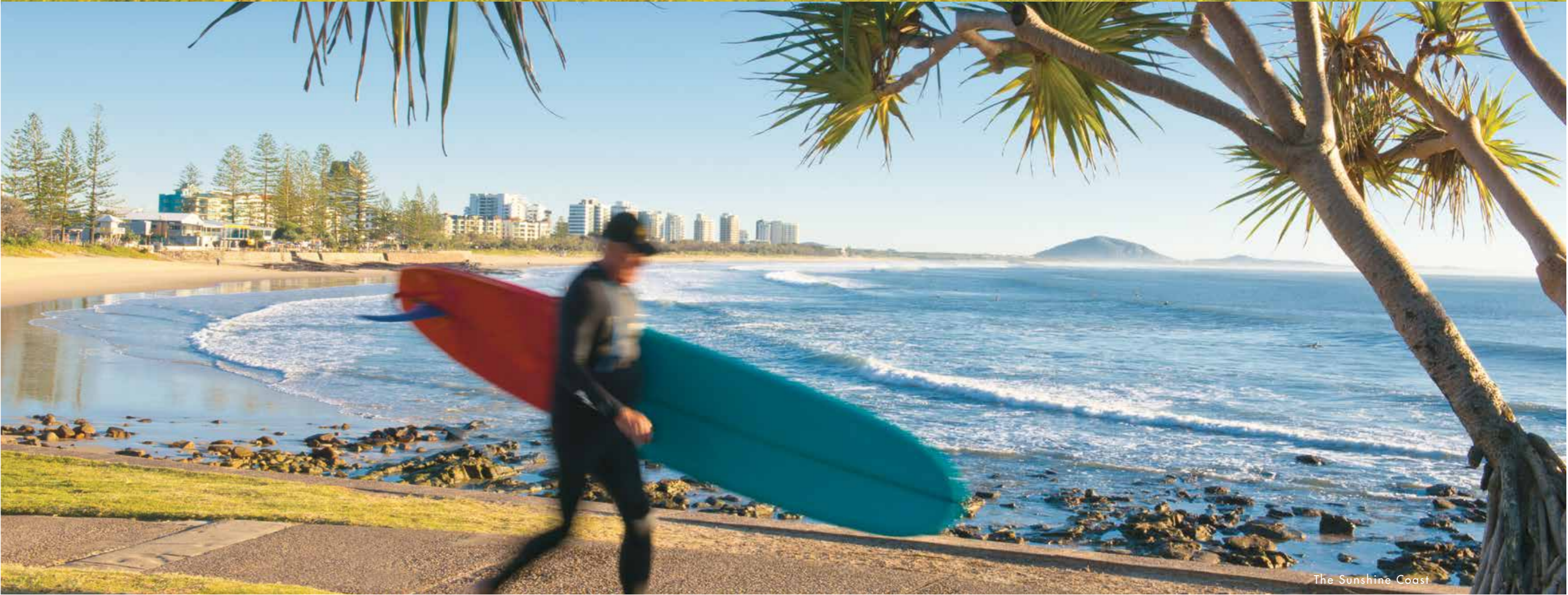
The Sunshine Coast