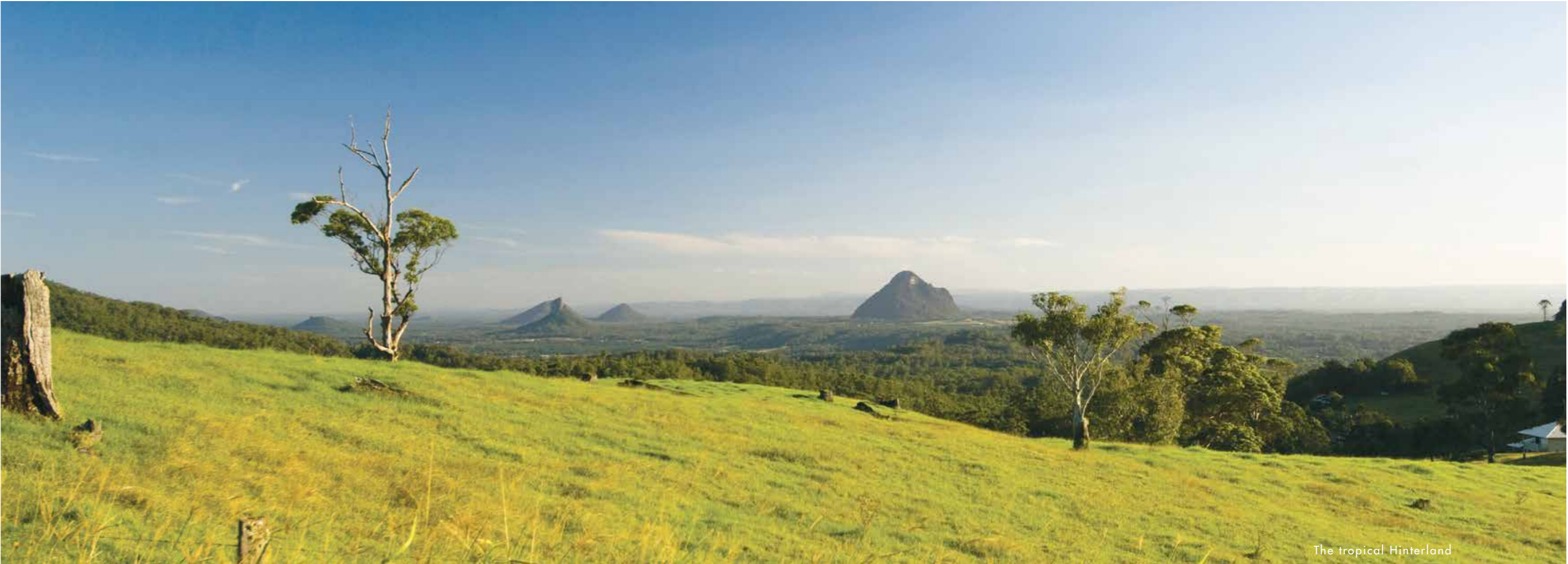
The tropical Hinterland

Harmony rests in the centre of everything that the Coast has to offer including cafés, restaurants, shopping and entertainment. The Coast's unique casual culture is genuine and welcoming and Harmony emulates this desirable authentic way of life.