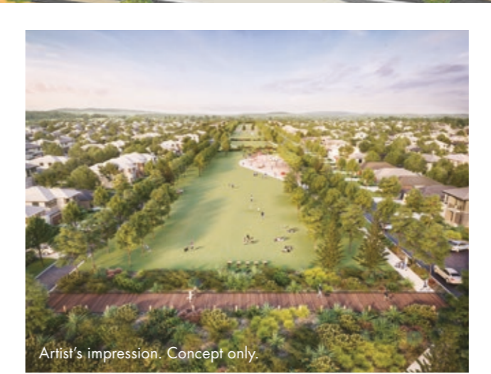
Artist's impression. Concept only.